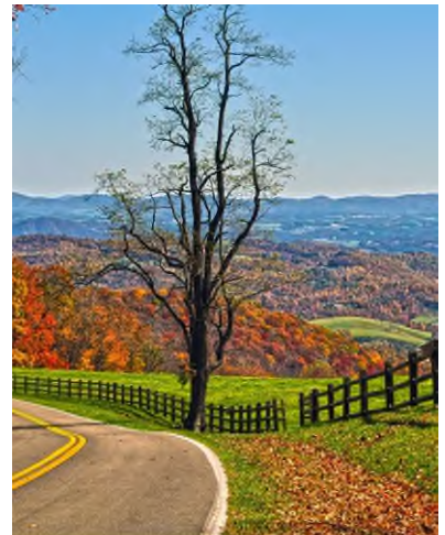
Blue Ridge Mountains